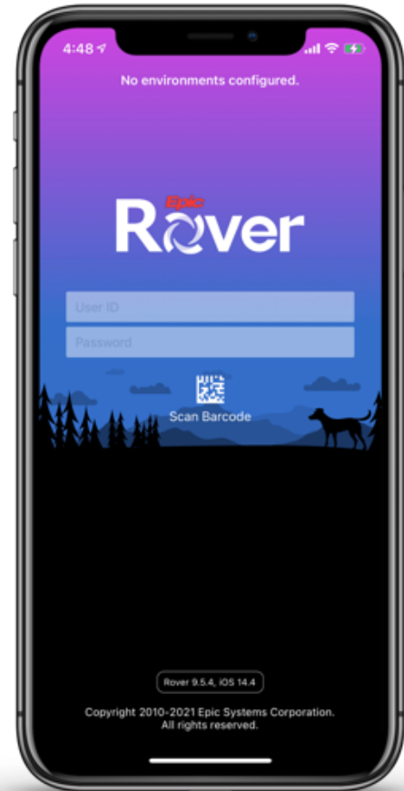
Figure 1: Log in screen for Epic Rover EHR

Online Licensing Also allows unlimited secure scans and decodes of 40+ types, and utilize additional features like accurate license management, device tracking, usage and performance analytics, and additional features on our roadmap.